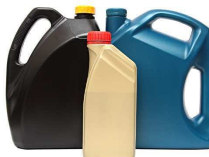
PE, PP & PET containers

Gives Gas Barrier Properties to Various Materials