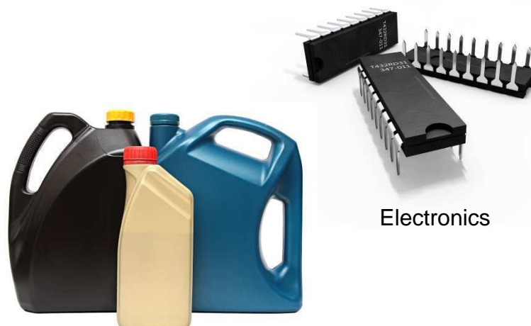
PE, PP & PET containers

Gives Gas Barrier Properties to Various Materials